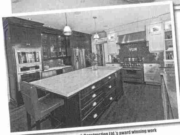
Westmark Construction Ltd.'s award winning work

provide our experience to the process, if we think we can improve something. We're actively engaged in trying to improve conditions."