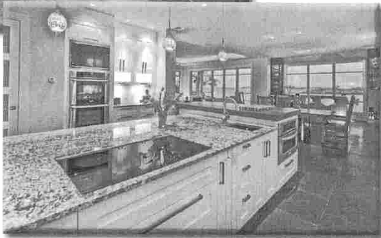
Westmark Construction Ltd.'s award winning work